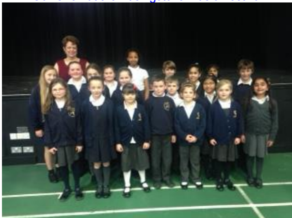
Our Choir at the Basingstoke Music Festival